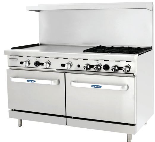
Gas Range Griddle Combinations (ATO-4B36G)