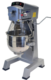
Planetary Mixers (PPSL-30)