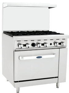
Gas Ranges (ATO-6B)