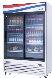
Bottom Mount 2 Door Lighted Sliding Glass Refrigerator (MCF8709)