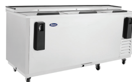
Bar Coolers (MBC80)