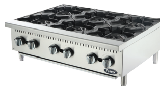
Hot Plate (ATHP-36)