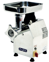
Meat Grinders (PPG-22)