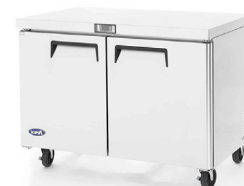
Undercounter Refrigerators (MGF8402)