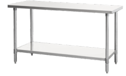
Work Table (MRTW-2436)