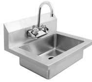
Welding Hand Wash Sinks (MRS-HS-18)