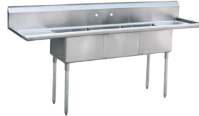
Stainless Steel Three Compartment Sinks (MRSB-3-D)