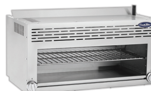
Cheese Melters (ATCM-36)