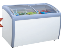
Glass Arc Lid Chest Freezer (MWF-9112)