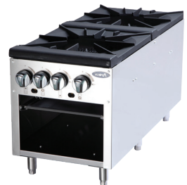
Stock Pot Stoves (ATSP-18-2L)