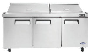
Sandwich Preps (MSF8304)