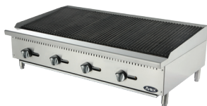
Char-Rock Broilers (ATCB-48)