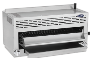
Salamander Broilers (ATSB-36)