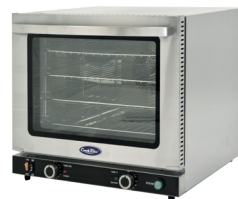
Convection Ovens (CRCC50-S)