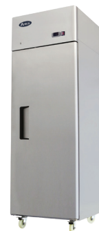
Top Mount Reach-ins (MBF8001)