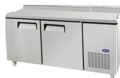
Pizza Prep (MPF8202)