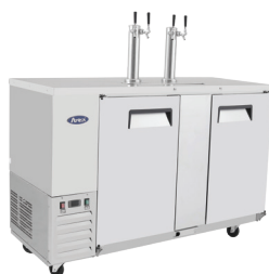
Keg Coolers (MKC58)