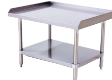
Stainless Steel Equipment Stand (ATSE-2836)