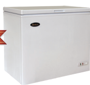
Solid Top Chest Freezers (MWF-9016)