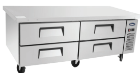
Chef Base (MGF8453)