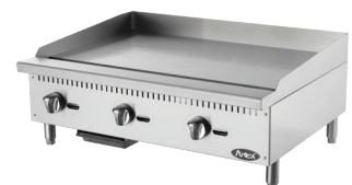
Manual Griddles (ATMG-36 HD 36)