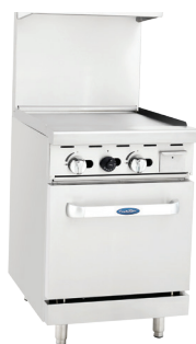
Gas Range Griddles (ATO-24G)