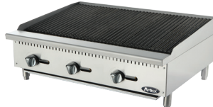
Radiant Broilers (ATRC-36)