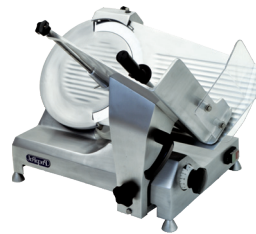
Meat Slicers (PPSL-14)