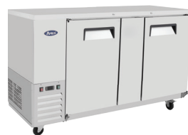
Back Bar Cooler (MBB69)