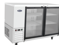
Back Bar Coolers (MBB59-G)

Other models from each series are available. Please see Autoquotes or our website for a the full spectrum of products: www.atosausa.com