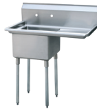
Stainless Steel One Compartment Sink (MRSA-1-R)