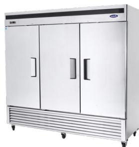
Bottom Mount Refrigerators (MBF8508)