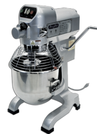
Planetary Mixers (PPM-20)

Other models from each series are available. Please see Autoquotes or our website for a the full spectrum of products: www.atosausa.com